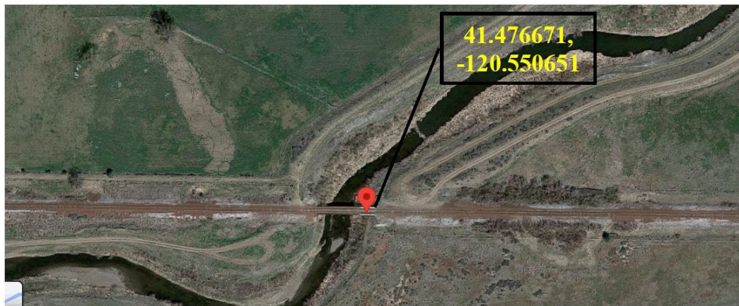
2) Proposed project location map