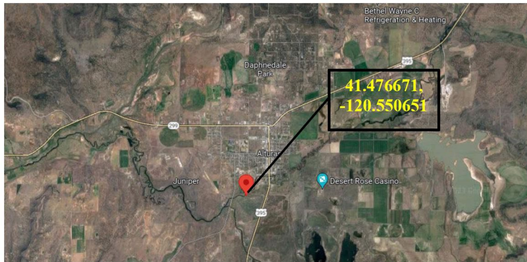
1) General vicinity map